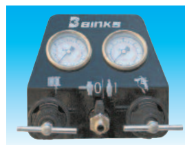
Easy to use controls