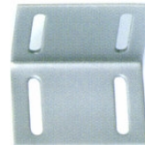
Mounting Angle 50 x 100 x 70 x 2.5 50 x 70 x 70 x 2.5 50 x 50 x 70 x 2.5