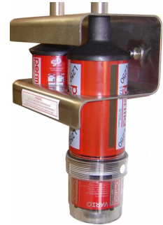
Duel Magneti Mounting Bracket ( MMB01 )