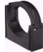
Perma Bracket ( A 105 )