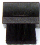
Oil Brush ( A 410 – 4 x 3 cm ) ( A 411 – 6 x 3 cm ) ( A 412 – 10 x 3 cm )