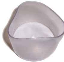
Clear Protective Cap ( A619 )