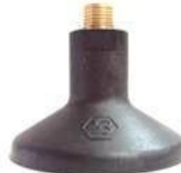
Flange ( A 620P Grease ) ( A 810P Oil )