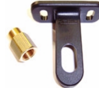
Perma Bracket ( A 150 ) with Insert ( A 151 )